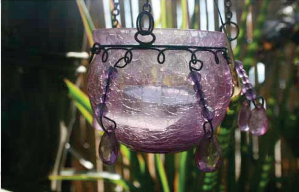
Glass candle holder in Spain

Once you have reflected and celebrated the previous year, the next step we are going to go through is a ritual of letting go of any negative energies to prepare ourselves. Before we do that, I wanted to cover a little introduction to rituals.